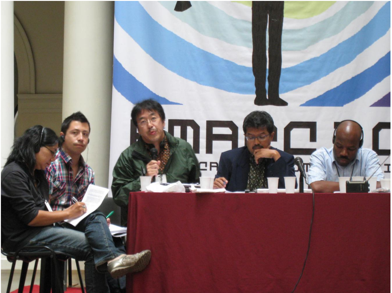
Seminar on Disaster Risk Reduction, AMARC 10, La Plata, Argentina, 2010