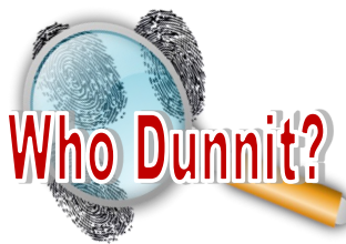
Mysteries and Clues