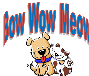
Learning with Cats & Dogs