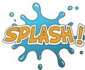
Summer Fun & Surprises

Educators are seeing strong declines in student retention due to an expanded summer break and adjustments in regular instruction this year (distant, hybrid, disruptions during in-person instruction) due to the pandemic.